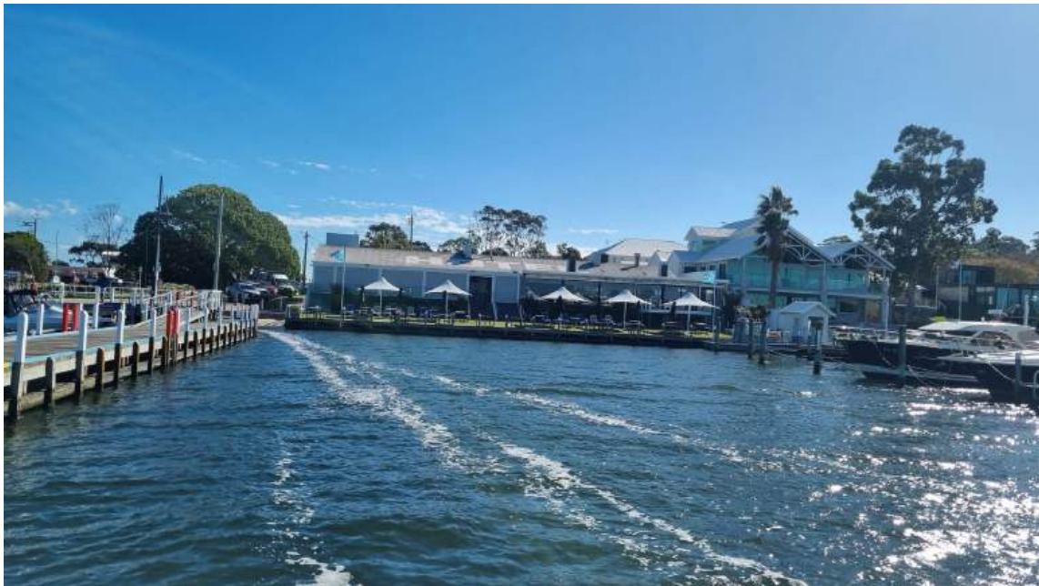
Peels River Cruise leaving Lakes Entrance for Metung: Lakes Entrance Tour

Front cover photo: Thomas - Junior bus driver in training.